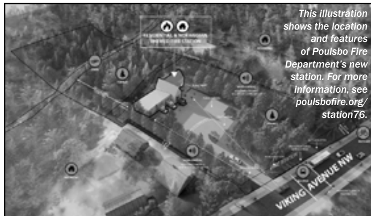
This illustration shows the location and features of Poulsbo Fire Department's new station. For more information, see poulsbofire.org/station76 .

growing number of taller commercial and multi-family residential buildings in the district.