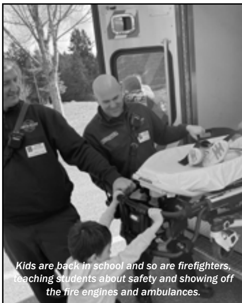
Kids are back in school and so are firefighters, teaching students about safety and showing off the fire engines and ambulances.